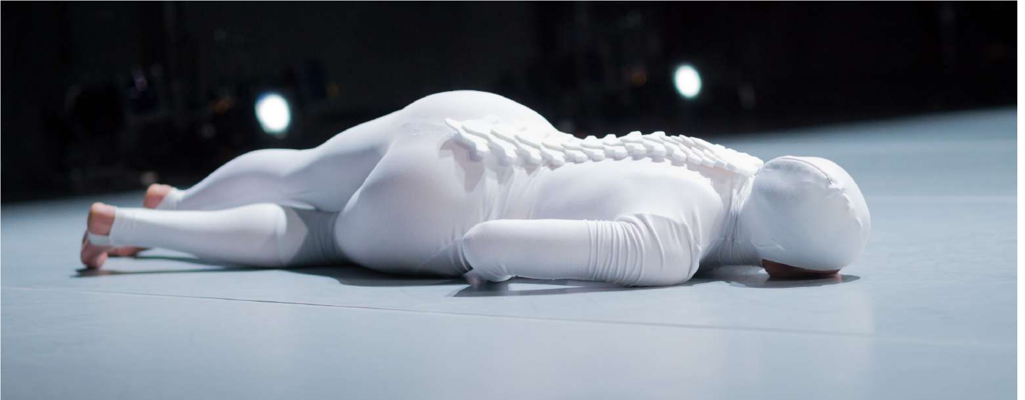
riccardo buscarini : works